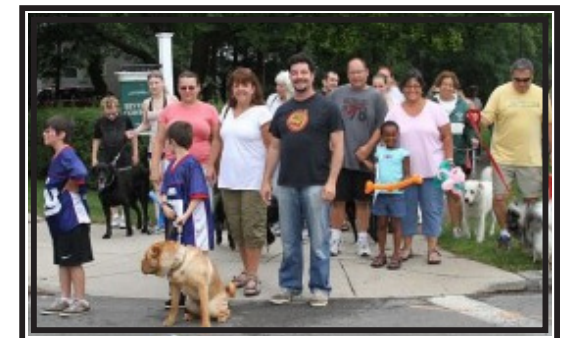
fun at last years strut

Sunday, May 22, 2011 Beverly Common, Beverly, MA 12 - 3:00 p.m. Rain or Shine Music, Food, Face Painting Fun for the entire family including the dogs. Prize for best dog costume!