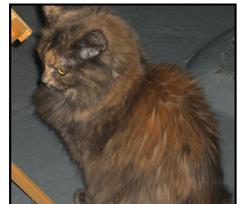
Misty Breeze - Available