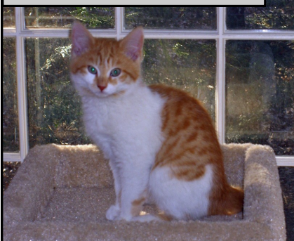
Patrick - Available with Phoebe