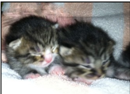
Newborns - Available Soon!