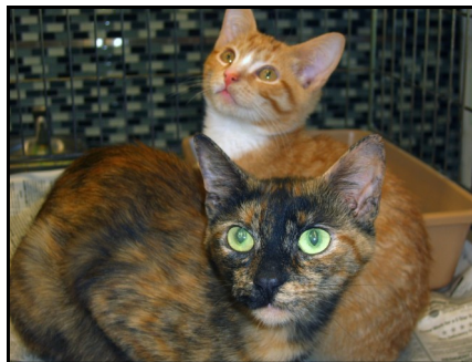
Mother Penny & Yo-Yo - Available For Adoption Together