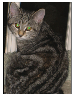
Phoebe - Available with Patrick