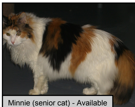
Minnie (senior cat) - Available