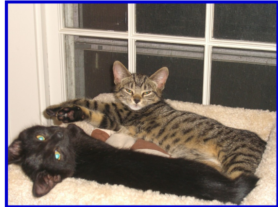
Olive & Pepper - Ready for Adoption!

previous dog, who lived to be 14 years old, but she didn't get another dog because she needed to care for her elderly parents and a disabled child for the last few years. She sounds like a very nice woman who would provide a loving home, complete with fenced in yard, for the right pooch. If you can help in any way, please write bhannable@gmail.com or call 978-922-7190. Thanks!