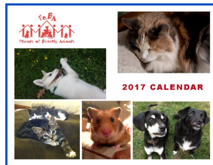
2017 CALENDAR COVER