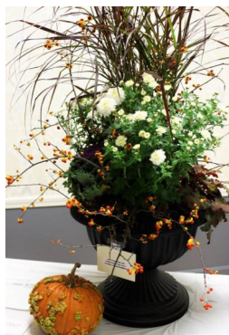
PHOTOS FROM THE FUR BALL