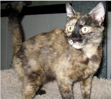
Left: Lovely tortie Tess was very glad to get a home for the holidays.