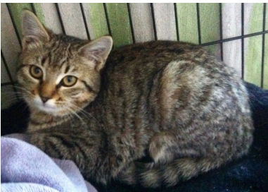
Left: Penelope, an adorable, sweet five-month old tabby. No more living in the cold and snow for her. She now lives in Hamilton with a family who will love her and keep her warm for the rest of her life.