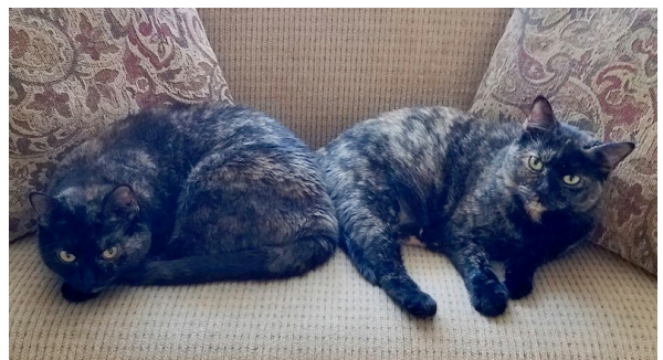
Right: Two gorgeous tortie sisters, Echo and Shadow, were adopted in January 2017.