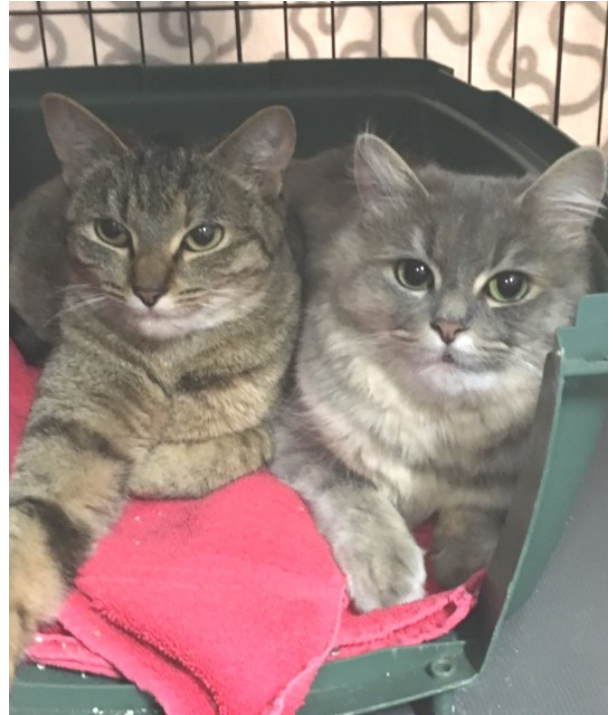
Lucy & Norma

The two kittens have adapted wonderfully to life indoors while I have fostered them and it has been so rewarding to watch them thrive. They have been adopted and named "Lucy" and "Norma" by their new pet parent. In just a few days they will be heading to their new forever home.