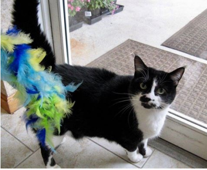
Left: Boo Boo, a pretty, friendly black and white female cat with a very warm heart, now has a new home.